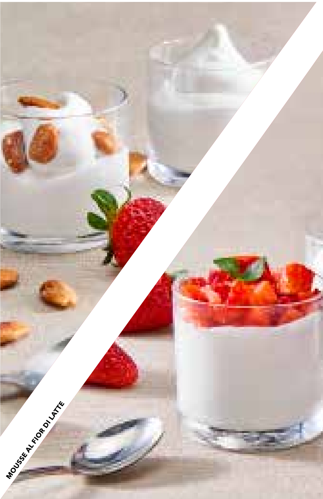
MOUSE AL FIOR DI LATTE